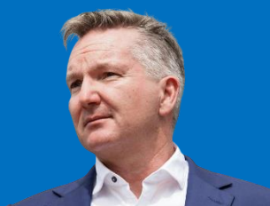
Chris Bowen, Minister for Climate Change and Energy

Nor do I believe you can just turn away from gas immediately.”