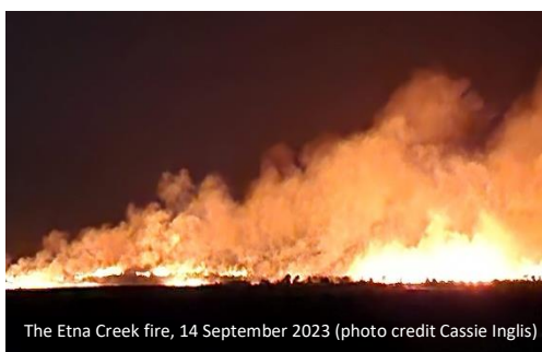
The Etna Creek fire, 14 September 2023

Early this month, a bushfire burnt through 3,600ha of land south of Dingo and then another 1,000 ha of land and the stockyards at Belmont Research Station were destroyed in a grassfire at Etna Creek.